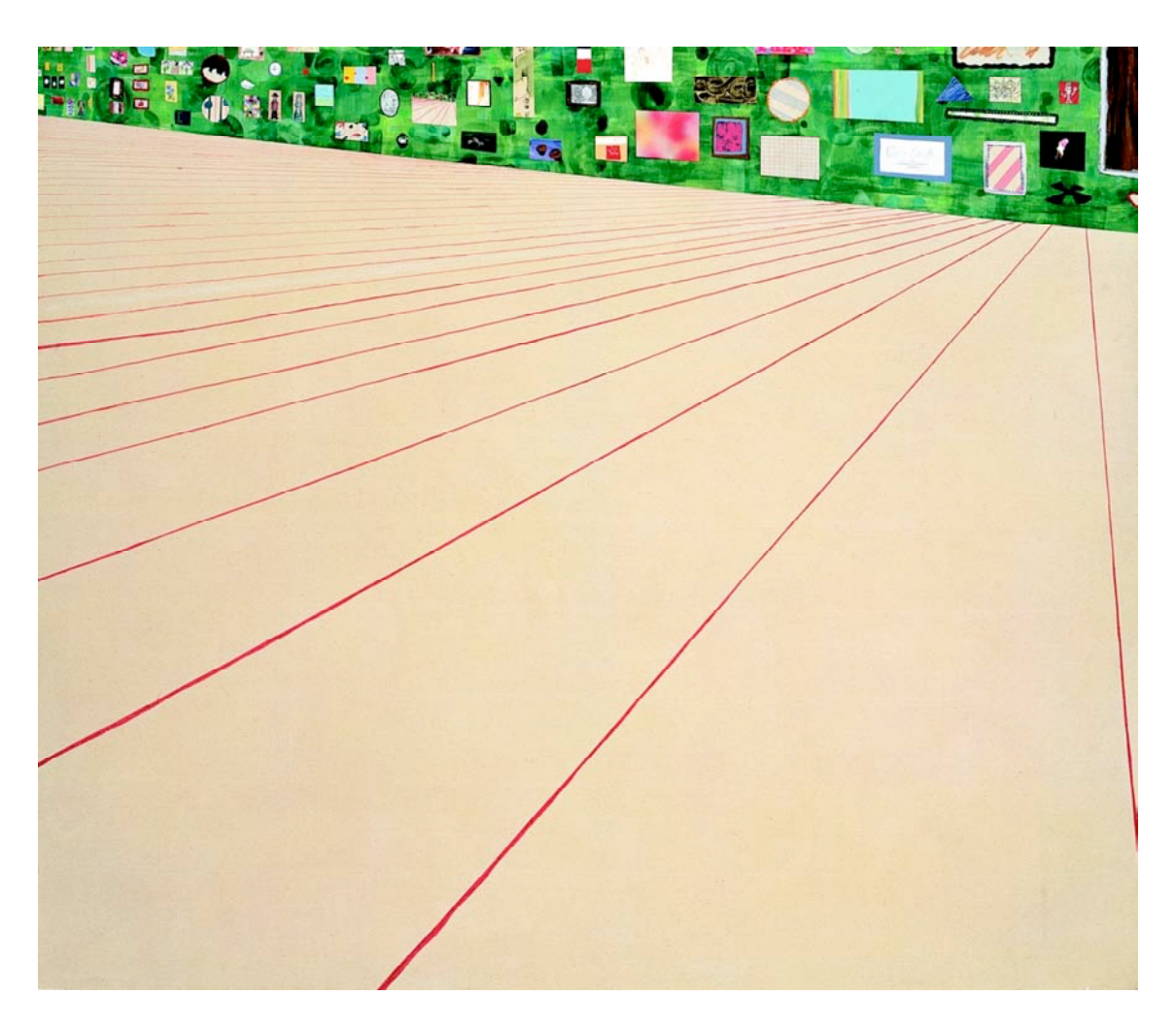
Figure 3: Laura Owens, Untitled , 1995, oil, acrylic, enamel, marker and ink on canvas, 72 1/2 x 84 1/4 inches, LO 95 017, Courtesy the artist/Gavin Brown's enterprise.