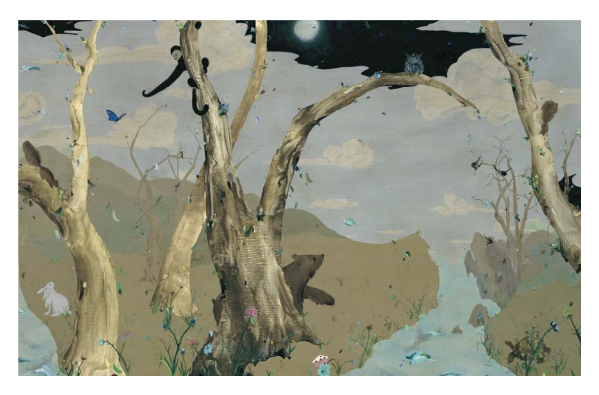
Figure 12: Laura Owens, Untitled , 2002, oil and acrylic on linen, 84 x 132 inches, LO 207