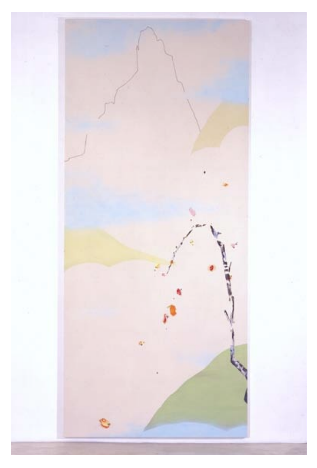
Figure 8: Laura Owens, Untitled , 1999, acrylic and oil on canvas, 150 x 66 inches, LO 109, Courtesy the artist/Gavin Brown's enterprise.