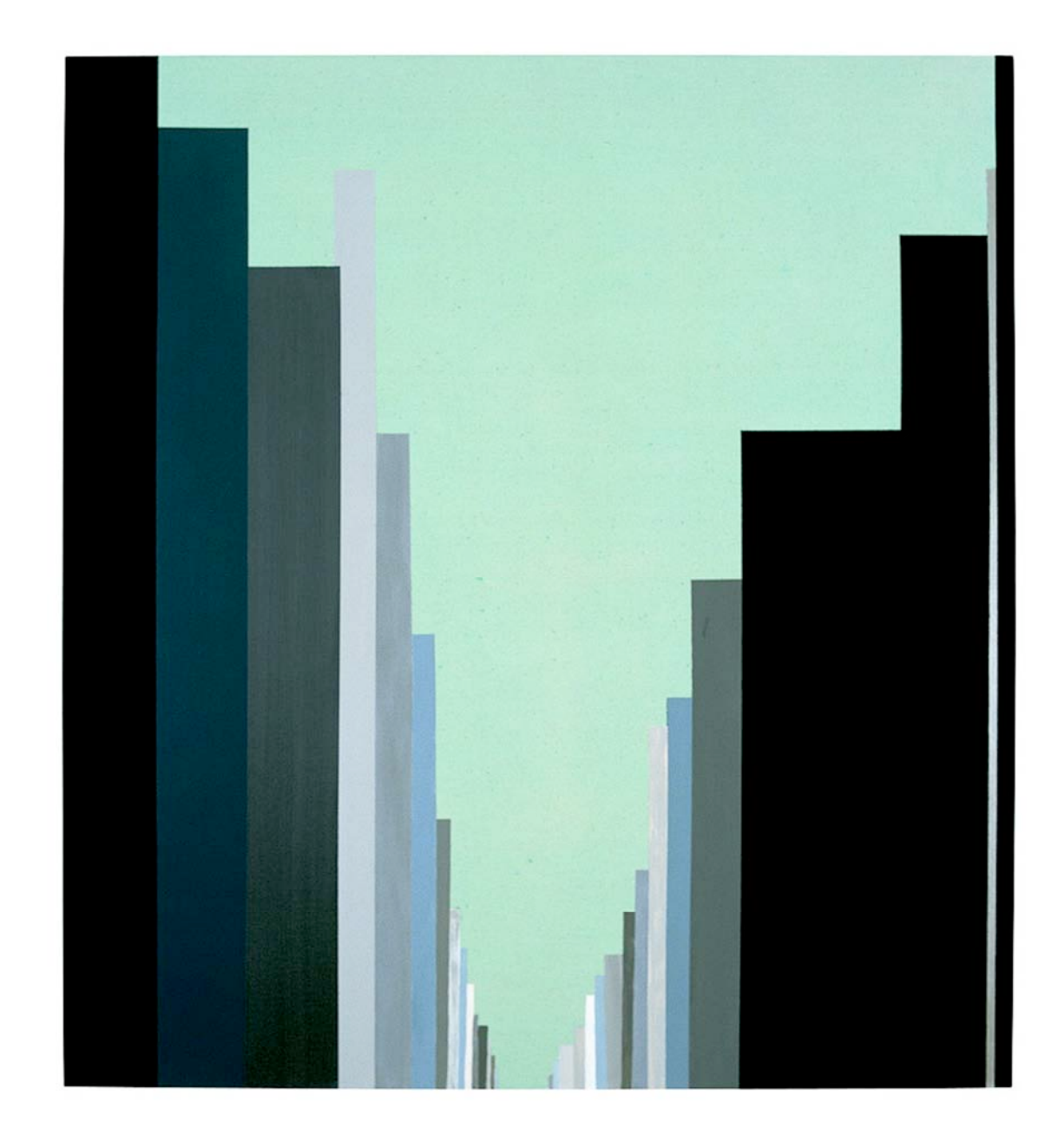
Figure 6: Laura Owens, Untitled , 1997, oil and acrylic on canvas, 49 3/4 x 45 1/2 inches, LO 033, Courtesy the artist/Gavin Brown's enterprise.