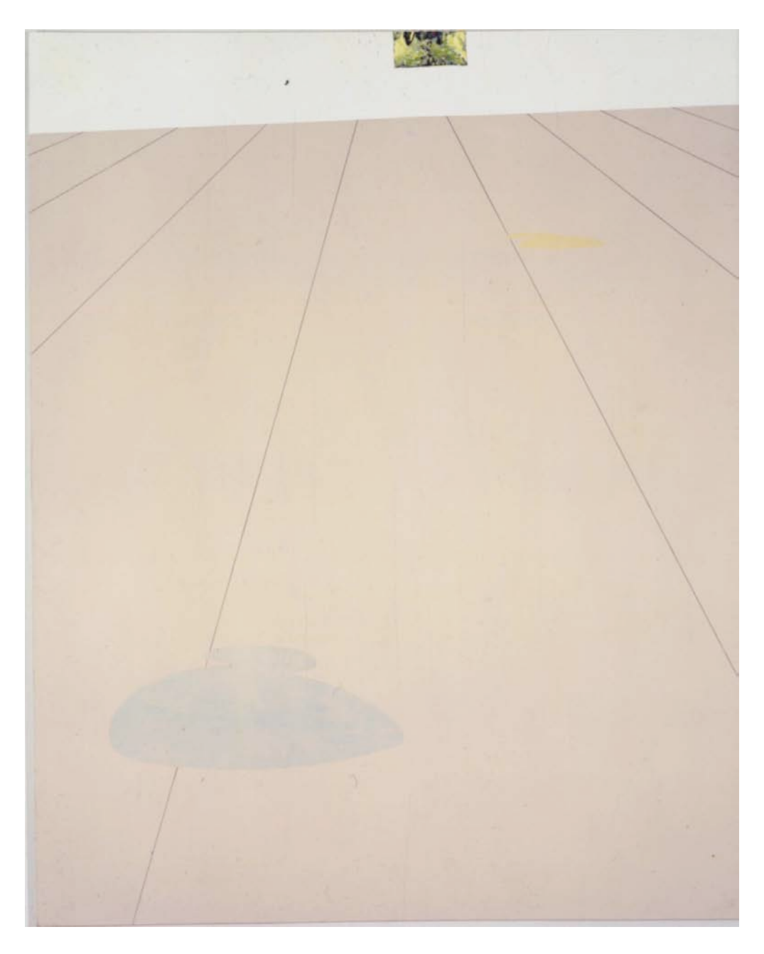
Figure 4: Laura Owens, Untitled , 1996, Acrylic on canvas, 120 x 96 inches, LO 002, Courtesy the artist/Gavin Brown's enterprise.