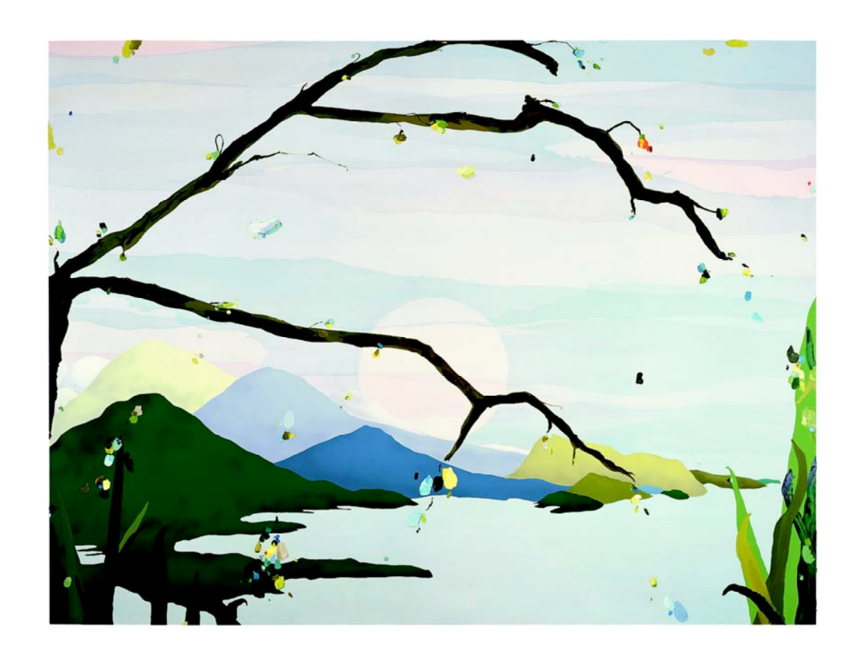
Figure 7: Laura Owens, Untitled , 2000, acrylic and oil on canvas, 9'2" x 11' LO 166, Courtesy the artist/Gavin Brown's enterprise.