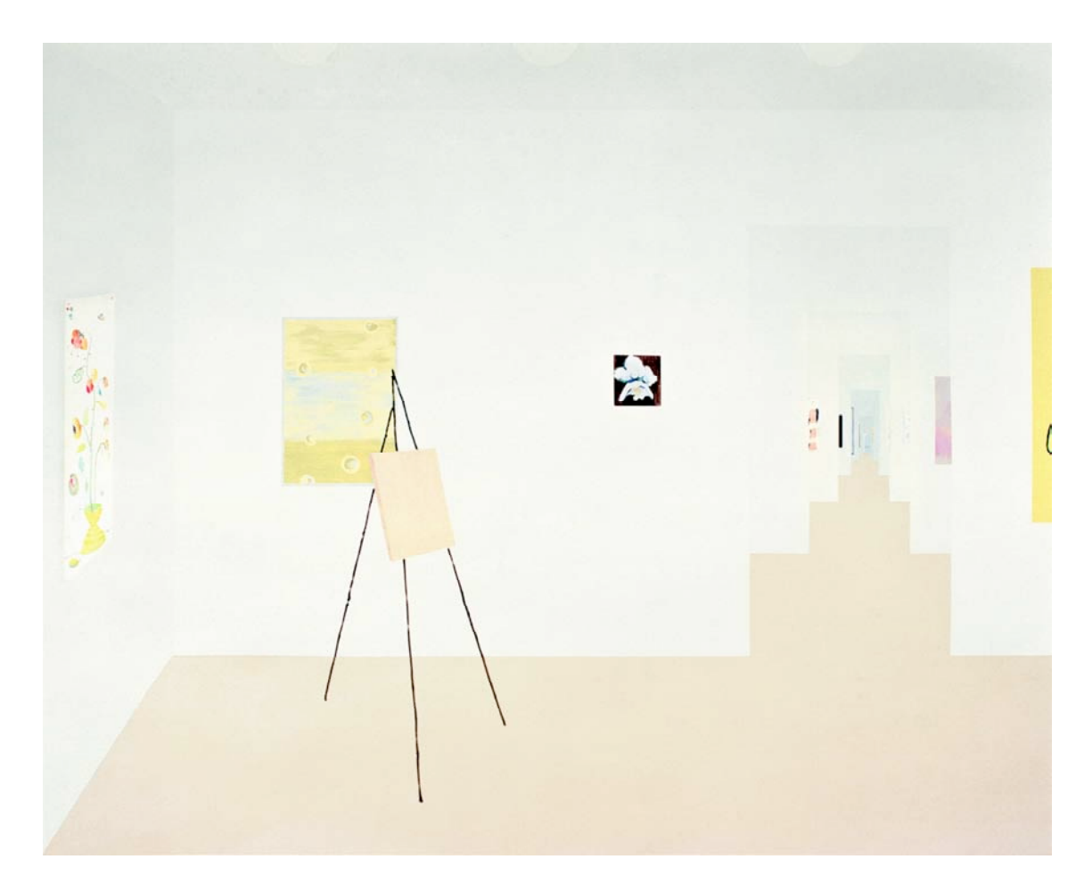
Figure 5: Laura Owens, Untitled , 1997, oil and acrylic on canvas, 96 x 120 inches, LO 030, Courtesy the artist/Gavin Brown's enterprise.