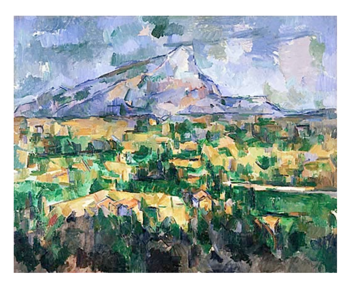
Figure 1: Paul Cézanne, Mont Sainte-Victoire , 1902-4, oil on canvas, 28 3/4 x 36 3/16 inches.