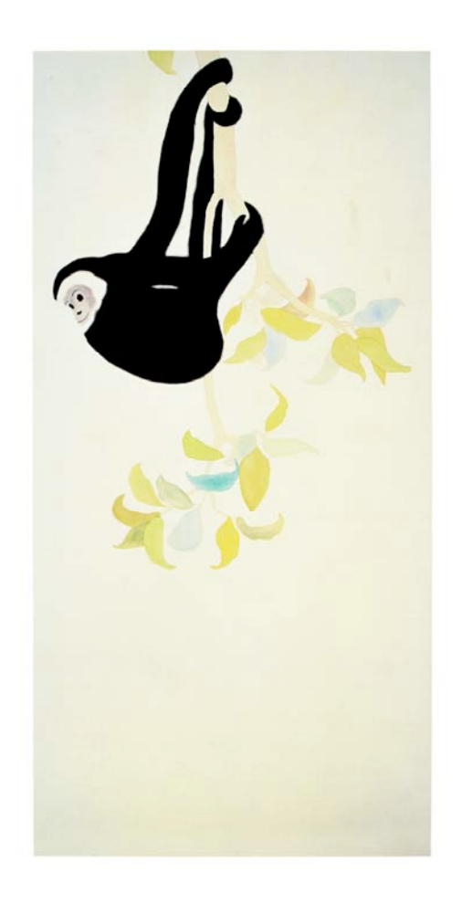
Figure 2: Laura Owens, Untitled , 1999, acrylic and ink on canvas, 2 parts, each 122 x 60 inches, LO 136, Courtesy the artist/Gavin Brown's enterprise.